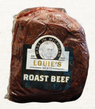
Top Round Roast Beef

Cooked top round beef (USDA Choice) for slicing. #91311 2/4 lb