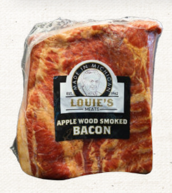
Applewood Bacon Slab