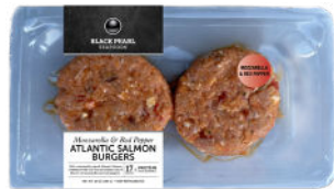
#2510 MOZZARELLA & RED PEPPER ATLANTIC SALMON BURGERS 12/10 oz