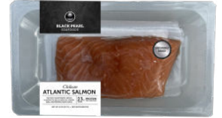
#2576 CHILEAN ATLANTIC SALMON 12/8 oz