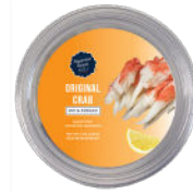
#92346 ORIGINAL CRAB DIP/SPREAD