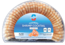
#9716 SHRIMP RING WITH COCKTAIL SAUCE 16 oz, 41-50, Cooked in Shell 12/16 oz