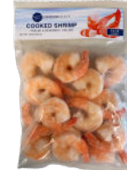
#9613 COLOSSAL P&D COOKED SHRIMP 13-15, Tail-On, Bagged 10/1 lb