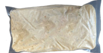
#92632 SMOKED SALMON DIP/SPREAD 4/2.5 lb