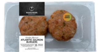
#2512 GARDEN HARVEST ATLANTIC SALMON BURGERS 12/10 oz