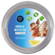
#92343 SMOKED WHITEFISH DIP/SPREAD