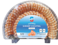
#9726 SHRIMP RING WITH COCKTAIL SAUCE 26 oz, 41-50, Cooked in Shell 8/26 oz