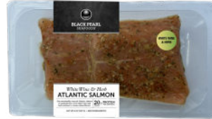
#2528 WHITE WINE & HERB ATLANTIC SALMON 12/8 oz