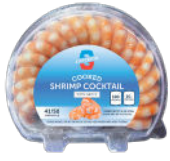
#9710 SHRIMP RING WITH COCKTAIL SAUCE 10 oz, 41-50, Cooked in Shell 12/10 oz