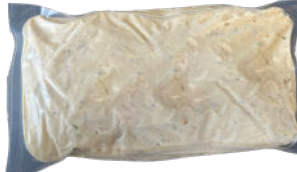
#92630 SMOKED WHITEFISH DIP/SPREAD 4/2.5 lb