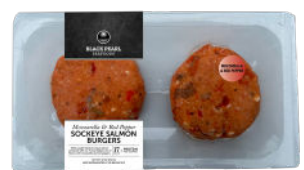
#2515 MOZZARELLA & RED PEPPER SOCKEYE SALMON BURGERS 12/10 oz