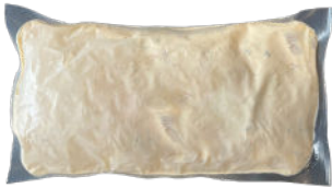
#92625 SHRIMP & CRAB DIP/SPREAD WITH HORSERADISH 4/2.5 lb