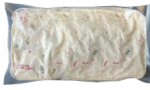
#92618 CRAB & GREEN ONION DIP/SPREAD 4/2.5 lb