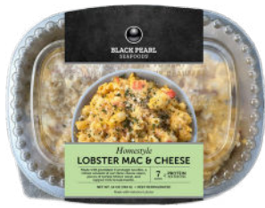
#92234 HOMESTYLE LOBSTER MAC & CHEESE WITH BREADCRUMBS 6/14 oz