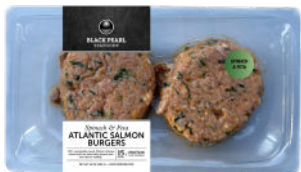
#2503 SPINACH & FETA ATLANTIC SALMON BURGERS 12/10 oz