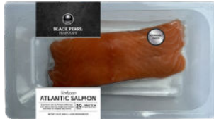
#2588 VERLASSO ATLANTIC SALMON 12/10 oz