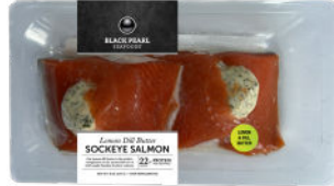
#2525 LEMON DILL BUTTER SOCKEYE SALMON 12/8 oz