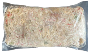
#92626 MAINE STYLE LOBSTER ROLL SALAD 4/2.5 lb