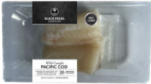
#2586 WILD CAUGHT PACIFIC COD 12/8 oz