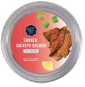
#92350 SMOKED SOCKEYE SALMON DIP/SPREAD