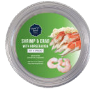
#92345 SHRIMP & CRAB DIP/SPREAD