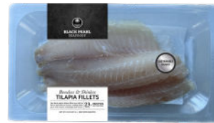
#2584 TILAPIA FILLETS 12/8 oz