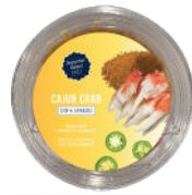
#92354 CAJUN CRAB DIP/SPREAD