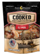
#9870 PAUL PIAZZA LARGE EZ PEEL COOKED SHRIMP 21-30, Tail-On, Wild, USA 16/12 oz