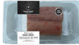
#2575 WILD CAUGHT MAHI MAHI 12/7.5 oz