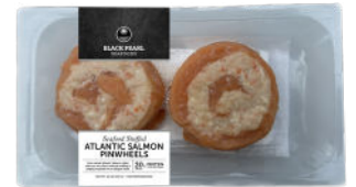
#2596 SEAFOOD STUFFED ATLANTIC SALMON PINWHEELS 12/12 oz