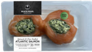
#2544 SPINACH & FETA STUFFED ATLANTIC SALMON 12/10 oz