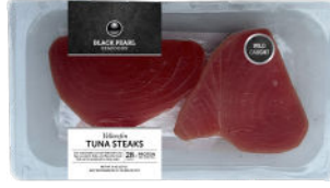
#2574 YELLOWFIN TUNA STEAKS 12/7.5 oz