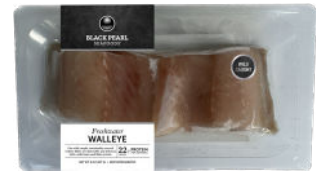
#2585 FRESHWATER WALLEYE 12/8 oz