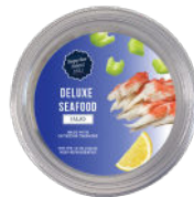
#92509 DELUXE SEAFOOD SALAD