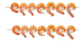
#6396 SHRIMP SKEWERS 15/BOX, 42/47 ct 4/2.25 lb