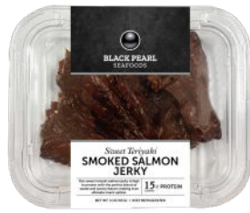
#83996 SWEET TERIYAKI SMOKED SALMON JERKY 8/3 oz