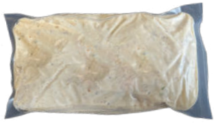
#92621 ORIGINAL CRAB DIP/SPREAD 4/2.5 lb