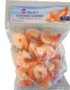
#9616 JUMBO P&D COOKED SHRIMP 16-20, Tail-On, Bagged 16/12 oz