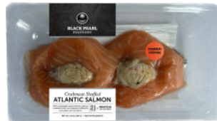
#2558 CRABMEAT STUFFED ATLANTIC SALMON 12/10 oz