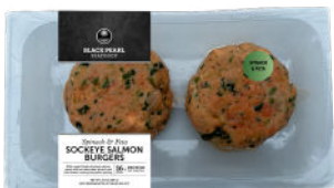
#2513 SPINACH & FETA SOCKEYE SALMON BURGERS 12/10 oz