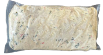
#92620 CRAB & SPINACH DIP/SPREAD 4/2.5 lb