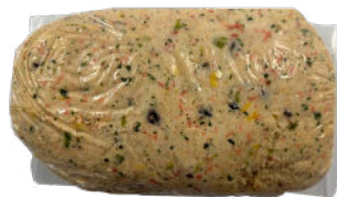
#92646 NEW SOUTHWEST CRAB SALAD 4/2.5 lb