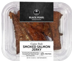
#83995 CAJUN STYLE SMOKED SALMON JERKY 8/3 oz