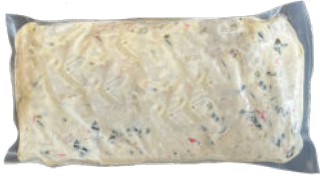
#92606 CRAB & GREEN ONION CHEESEBALL 4/2.5 lb