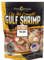
#9833 PAUL PIAZZA EZ PEEL RAW SHRIMP 16-20, Wild, USA 10/1 lb