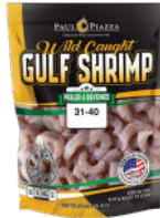
#9824 PAUL PIAZZA P&D RAW SHRIMP 31-40, Tail-Off, Wild, USA 10/1 lb