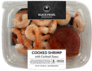
#2497 COOKED SHRIMP WITH COCKTAIL SAUCE 12/7 oz