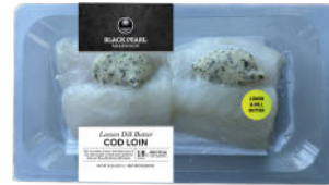
#2559 NEW LEMON DILL BUTTER COD LOIN 12/8 oz