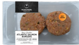
#2511 SPICY CHEDDAR ATLANTIC SALMON BURGERS 12/10 oz