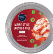
#92352 MAINE STYLE LOBSTER ROLL SALAD