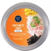
#92644 SOUTHWEST CRAB SALAD