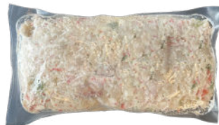
#92623 DELUXE SEAFOOD SALAD 4/2.5 lb