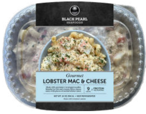
#92232 GOURMET LOBSTER MAC & CHEESE 6/14 oz