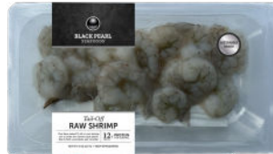
#2713 TAIL-OFF RAW SHRIMP 12/8 oz