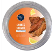
#92344 SMOKED SALMON DIP/SPREAD