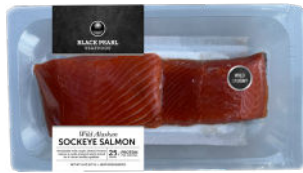
#2577 ALASKAN SOCKEYE SALMON 12/8 oz