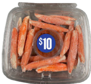
#2909 NEW SURIMI TRAY WITH COCKTAIL SAUCE 6/15 oz