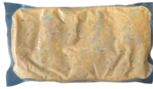
#92617 CAJUN CRAB DIP/SPREAD 4/2.5 lb