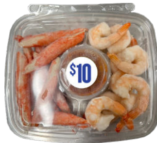
#2905 NEW SHRIMP & SURIMI TRAY WITH COCKTAIL SAUCE 6/15 oz