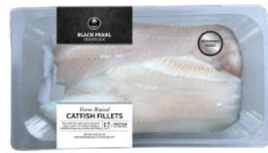
#2578 CATFISH FILLETS 12/8 oz