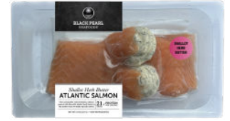
#2543 SHALLOT HERB BUTTER ATLANTIC SALMON 12/8 oz