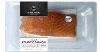
#2755 SCOTTISH ATLANTIC SALMON 12/10 oz