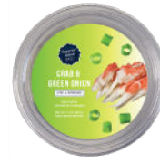
#92349 CRAB & GREEN ONION DIP/SPREAD