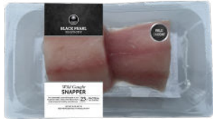
#2573 WILD CAUGHT SNAPPER 12/7.5 oz