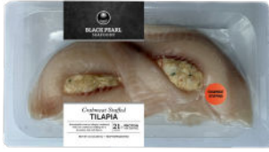
#2521 CRABMEAT STUFFED TILAPIA 12/10 oz