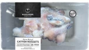
#2762 CATFISH NUGGETS 12/8 oz