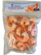
#9626 EXTRA LARGE P&D COOKED SHRIMP 26-30, Tail-On, Bagged 16/12 oz