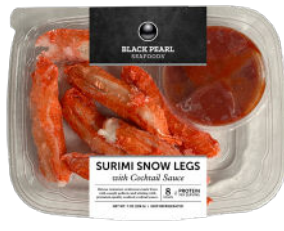
#2499 SURIMI SNOW LEGS WITH COCKTAIL SAUCE 12/7 oz