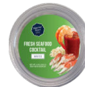
#93039 FRESH SEAFOOD COCKTAIL SAUCE