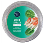
#92348 CRAB & SPINACH DIP/SPREAD