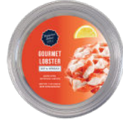
#92353 GOURMET LOBSTER DIP/SPREAD