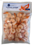
#9641 MEDIUM P&D COOKED SHRIMP 41-50, Tail-On, Bagged 16/12 oz