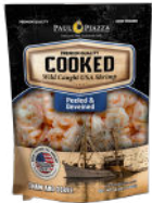
#9860 PAUL PIAZZA MEDIUM P&D COOKED SHRIMP 40-50, Tail-Off, Wild, USA 16/12 oz