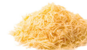
Cucina Adolina | 47205 Imported Shredded Parmesan Romano Asiago Blend Cheese 4/5 lb

The finest quality Feta cheese in the U.S.A. This ancient style Greek cheese is a great salad topper and is used in a wide range of new-age dishes.