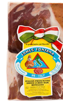
Ermes Fontana | 2692 Fontana Prosciutto Deli Loaf 10.5 lb Authentic Italian Prosciutto di Parma in a convenient vacuum-sealed loaf, perfect for slicing at deli counters and restaurateurs alike.