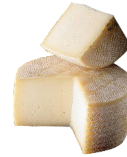
Don Juan | 7105 Aged Castellano Manchego Cheese 2/7 lb

Made from the milk of Manchega sheep using old world techniques in the state-of-the-art facilities, this cheese is aged six months and features a floral start and a nutty finish. One of three award winning Don Juan Manchego cheeses.