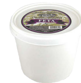
Cucina Adolina | 47181 Feta Cheese 2/8 lb

Add an unrivaled depth of flavor to your recipes with this shredded Asiago cheese. This premium cheese provides a sweet, slightly tangy flavor with a tempting, mouthwatering aroma.