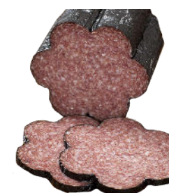
Black Kassel | 2691 Old Forest Salami 2/2.25 LB Gently smoked with blends of hardwoods and cured with a legion of spices. Black Kassel artfully blends old-world recipes and crafting traditions with today's demand for distinct, quality products.