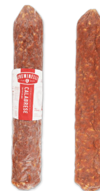
Creminelli | 45261 Calabrese Italian Salami 3/3 lb The original pepperoni, mildly spicy, perfect for pizza. Made with organic chili pepper and paprika.