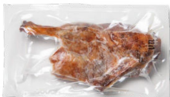
7017 Partially Boned Roasted Duck Half 12/15 oz

Versatility that allows creation of signature menu items