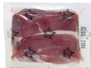
90015 Skin-On Boneless Duck Breast 24/6.5-9.5 oz